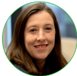
Kate du Preez Commissioner for Resources Safety and Health